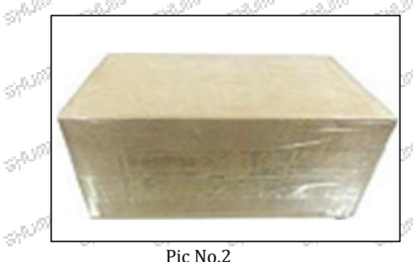
Domestic express packaging: Wrapped by Transparent tape

Minors are prohibited from using transparent tape, yellow tape, black wrapping protective film, and white wrapping protective film to avoid personal injury.